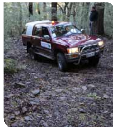
The Brook hilux in action