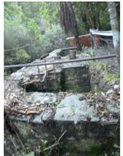
Historic structures from the 1868 waterworks after being cleared by members of the track cutter team.